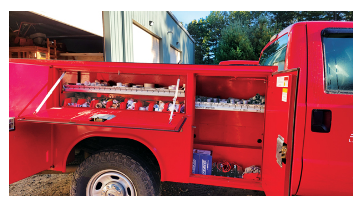
Boost Offseason Productivity with an Organized Truck