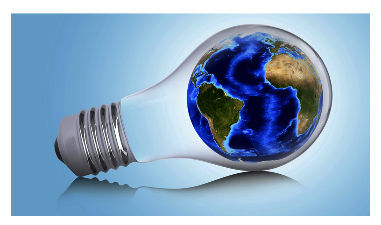
APR Supply Co. Editorial- Vol. 4: Inventions Shaping the Trades