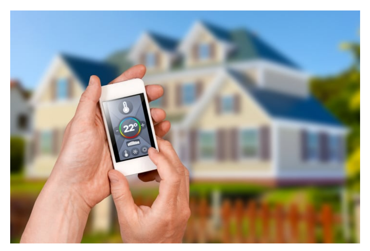
APR Supply Co. Editorials- Vol. 3 - The Evolving Landscape

Smartphone Technology's Impact on HVAC and Plumbing Sectors