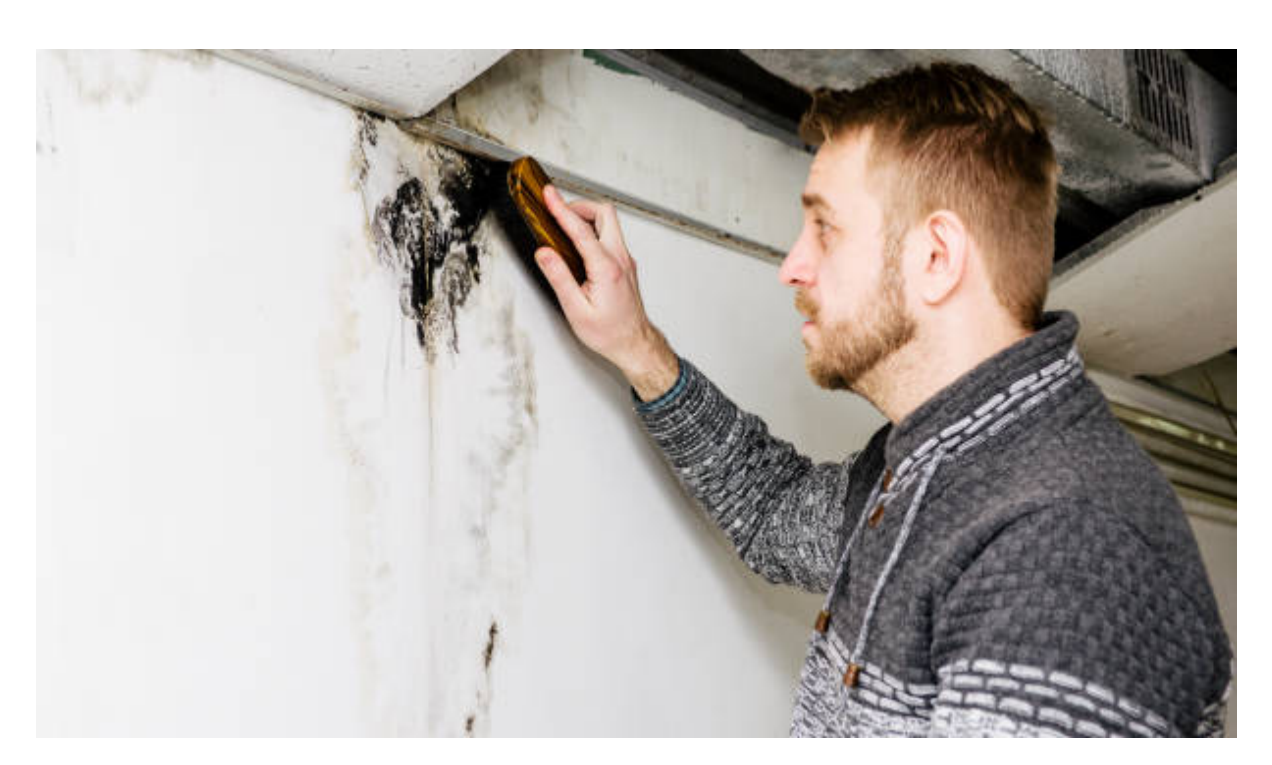
10 Warning Signs of Mold Plumbers Can Look Out For