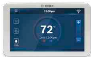
D Bosch BCC100 Wi-Fi Thermostat (2)

The BGH96 Gas Furnace offers up to 96% efficiency, a two-stage gas valve, and a multi-speed blower. This ENERGY STAR rated furnace offers premium comfort and energy savings. It is the perfect solution to efficiently heat your home.