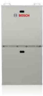
C Bosch BGH96 96% Furnace (2)

Dual fuel systems are the ideal solution to maximize comfort & efficiency