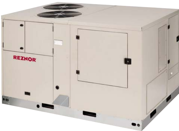
R7DA Model - front