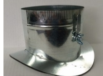
SADDLE COLLAR #305 - #315 W/Damper #326 W/Scoop #335 W/Scoop & Damper