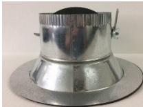
CONICAL TAKEOFF #308 #308D W/Damper