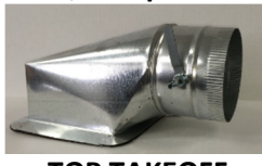
TOP TAKEOFF #1288 #1288D W/Damper