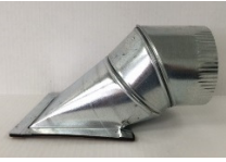
ADJUSTABLE NO RISE #V1264SNR