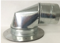
RND-RND TAKEOFF #1366SO