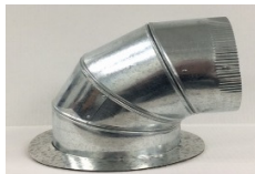
STICK-ON ELLBOW #306