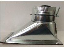
HIGH-EFFICIENCY 26 GA. TAKEOFF #1268 - #1268D W/Damper