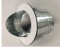
COLLAR W/SCOOP #303 #304 W/Damper