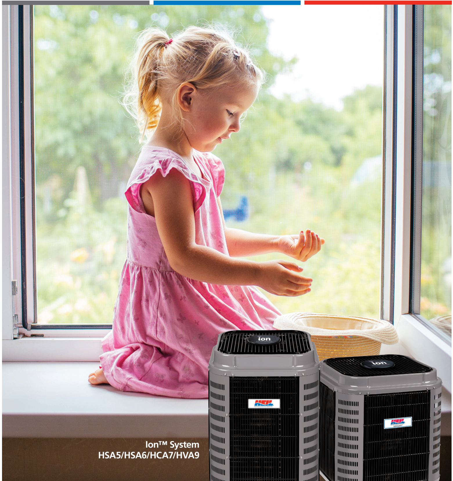
Ion™ System HSA5/HSA6/HCA7/HVA9